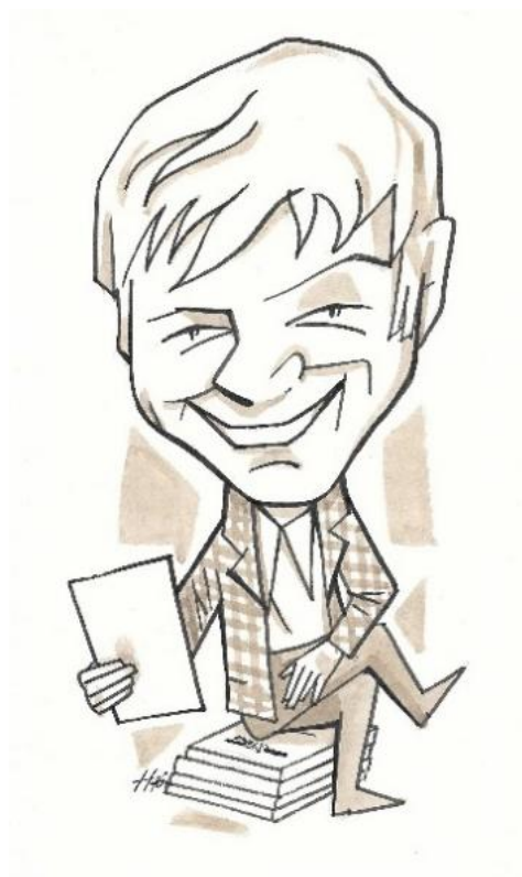
Fecit Stanislav Hlinovsky, CZ, 1972