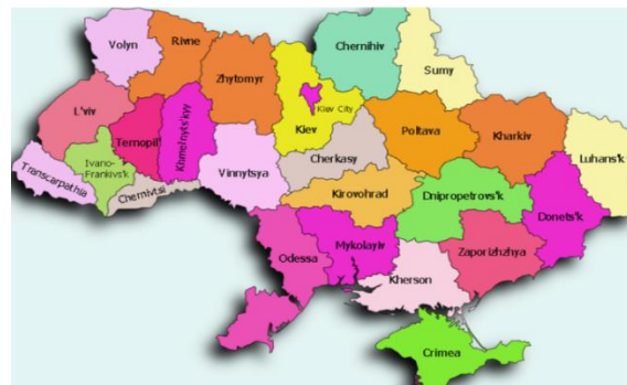
Ukraine for ever