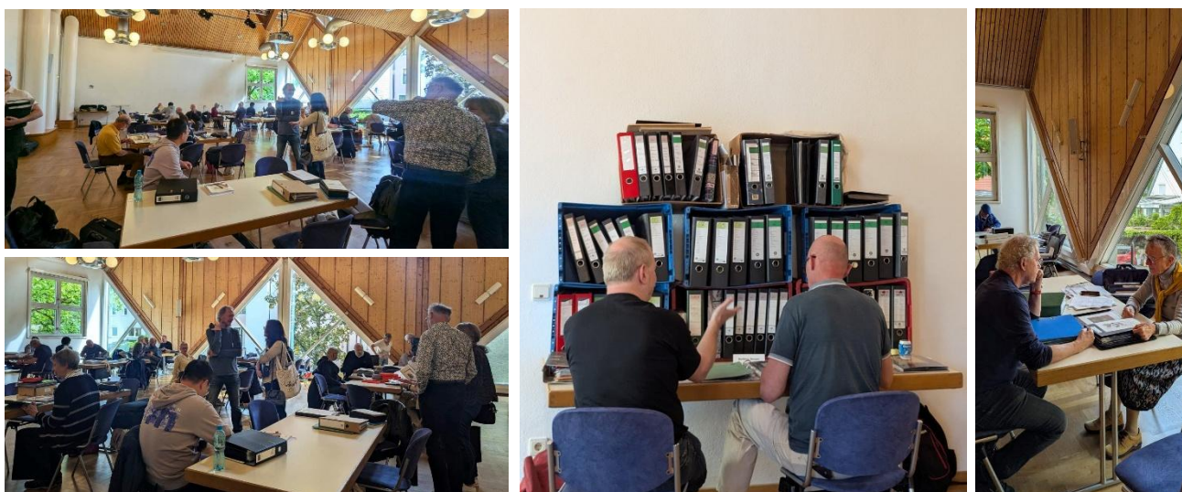
These four pictures are from the DEG meeting in Memmingen, Germany in May, 2025.

There is an attendance list which is being regularly updated on the Organizer's website. Many people from all around the world will join us in this inspiring adventure – exlibris artists, collectors, institutions and admirers. The attendance list will be updated regularly up to the start of the 41st FISAE Congress. See the list HERE !