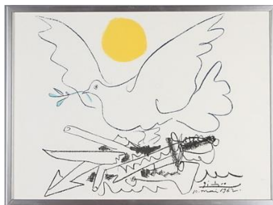
Worldwide! – also Gaza